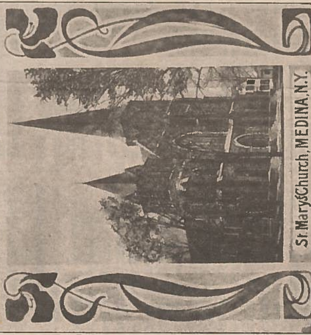
St. Mary's Church, MEDINA, N.Y.