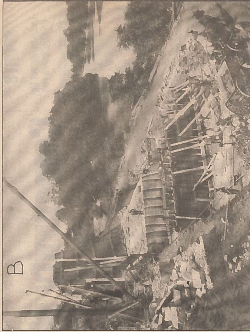
Photo B was taken on July 31, 1913, and shows the retaining wall pro-

This picture gives you a pretty good idea of how much wider the canal became when this project was completed.