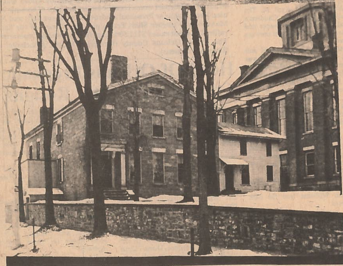
The old Jail and Sherrifs Residence, Albion.

Many residents will remember the Old Orleans County Jail and sheriff's residence which stood east of the Court House. It was a massive Medina Sandstone structure which was torn down in May 1971 for our present county jail. The upper photo here, taken from Platt St., shows how it looked with the Court House next to it.