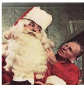
"A life well lived"