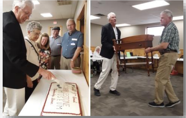
Committee members and guests at the 2023 Dinner.

It's time to renew your Cobblestone Society membership for 2024. (Memberships paid now will remain in effect until April 30, 2025.) We encourage you to also make plans to join us for our 6th Annual Membership Dinner to be held on Wednesday, May 8 at 5:00pm at the Carlton Recreation Center.