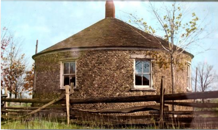
The round cobblestone school house in Potter lasted 83 years. Colorized photograph circa 1910.