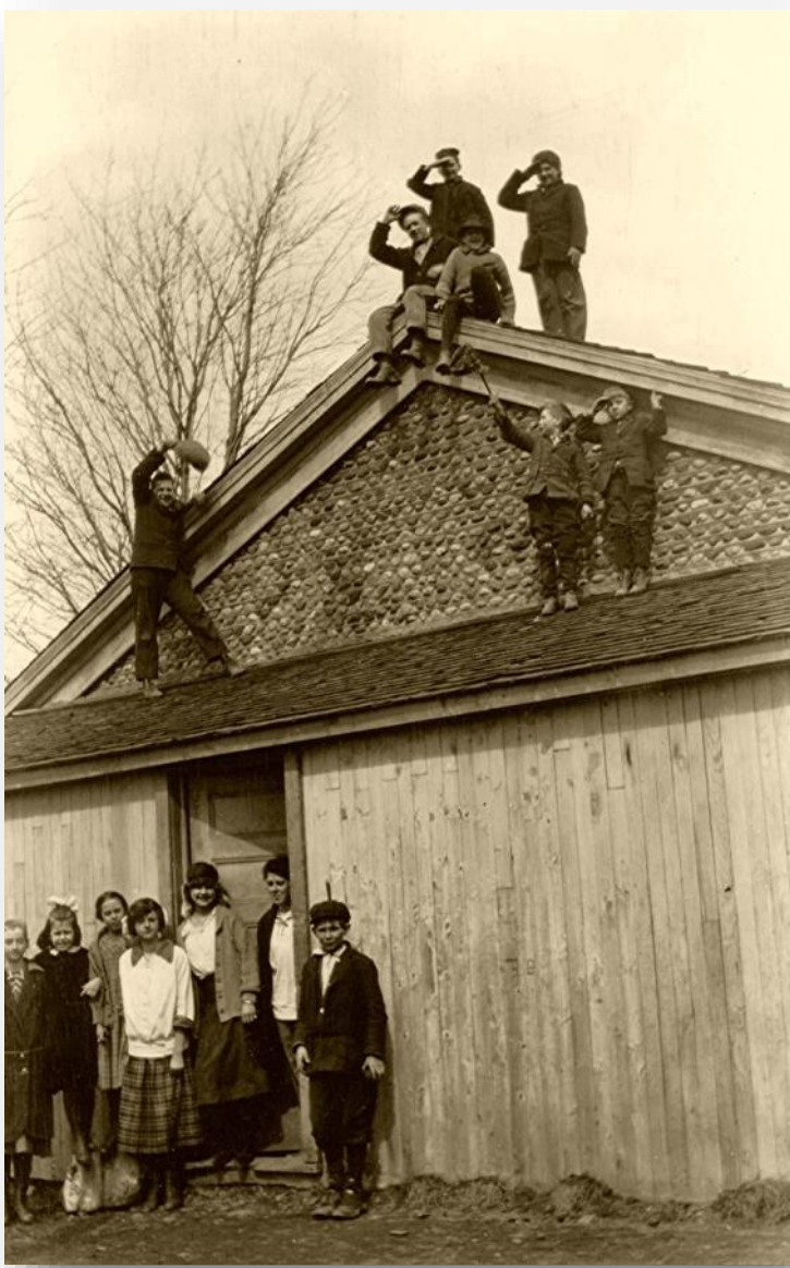
District #10 Schoolhouse, 9713 Seaman Road, Hartland, Ni- agara County