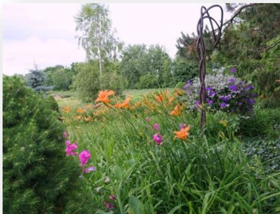
This year's Orleans County Garden Tour includes a stop at The Gardens at Colehill in Holley (left) and an incredible 4-course luncheon experience at Hurd Orchards (right).