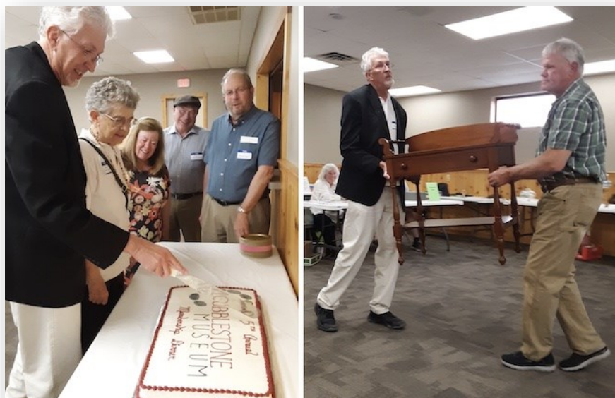
Committee members and guests at the 2023 Dinner.

The form on the back page of this Cobblestoner can be used to renew your membership and request your membership dinner tickets. Thank you!