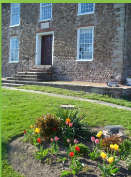
Plan your visit to the Cobblestone Museum!