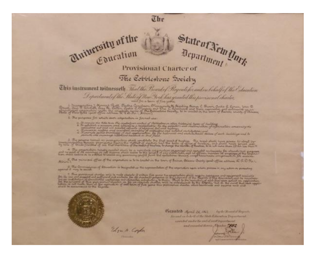
State Education Department Charter

We asked for a charter from the New York State Department of Education. And we were wise. That was our attorney's advice. "Get this charter from the state Department of Education if you possibly can." So we had the application for a charter and it was signed by, I think, the directors and the officers. By the end of the six months we had a temporary charter.