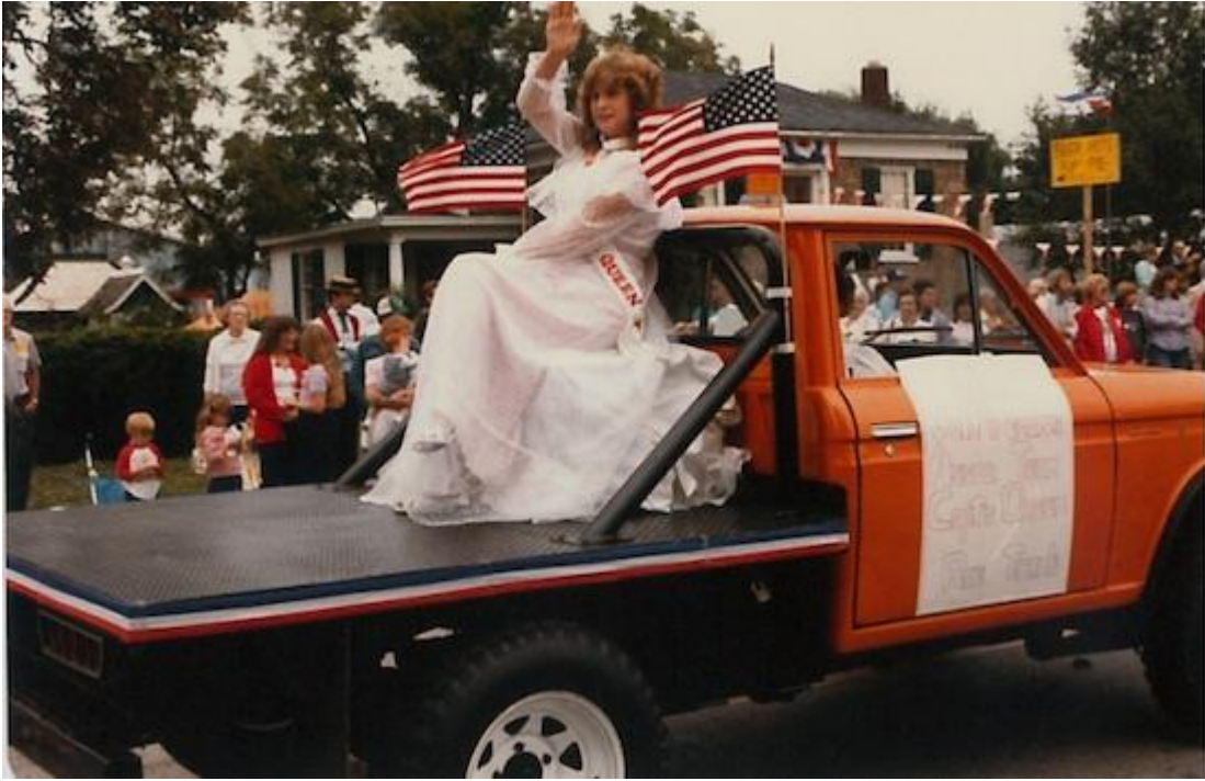
Queen for a day!