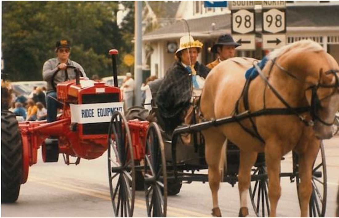
Ridge Equipment is ready to give Ol' Betsy a boost.