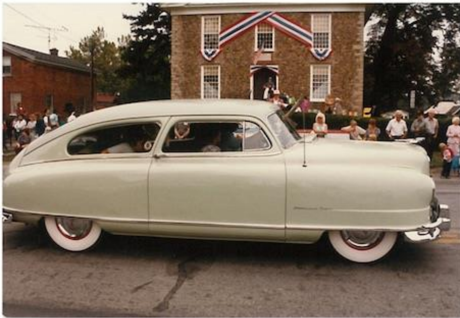
Dig those white sidewall tires!