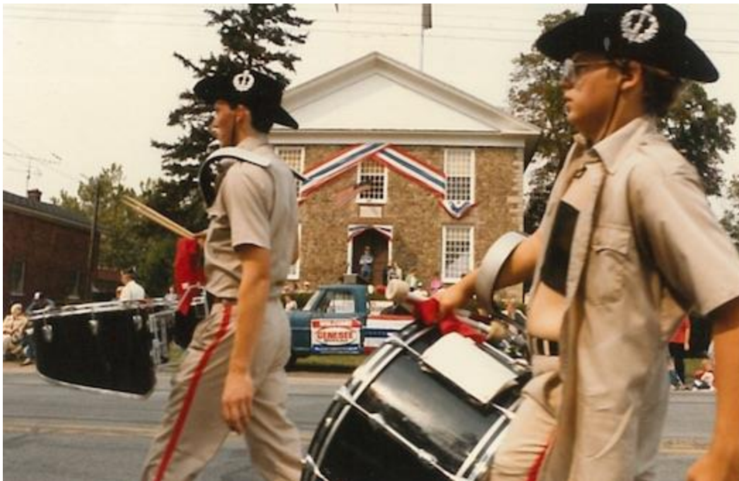
More members of the Firemen's Parade Champions, Knight Watch.