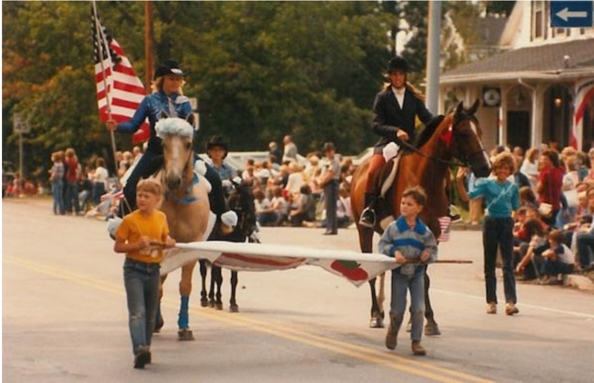
Even the horses got dressed up for the occasion.