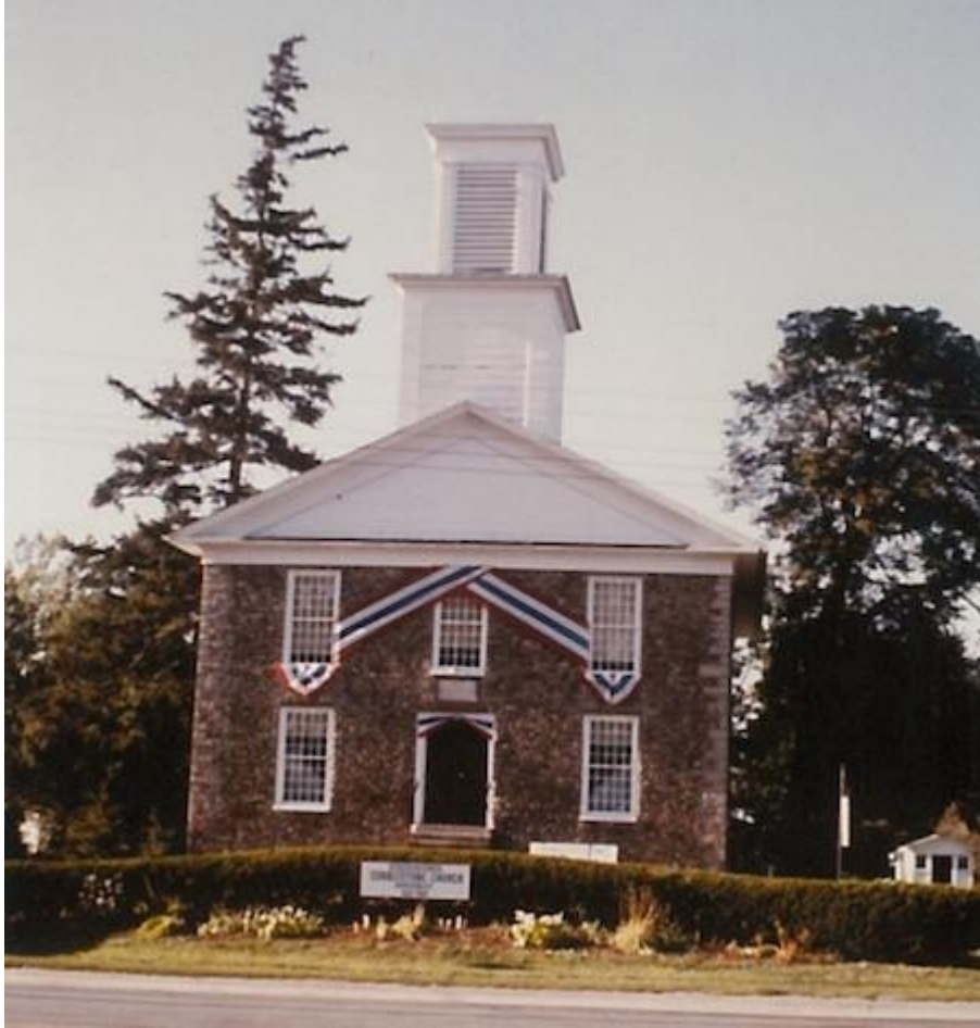
The Cobblestone Universalist Church is decorated for the patriotic observance.