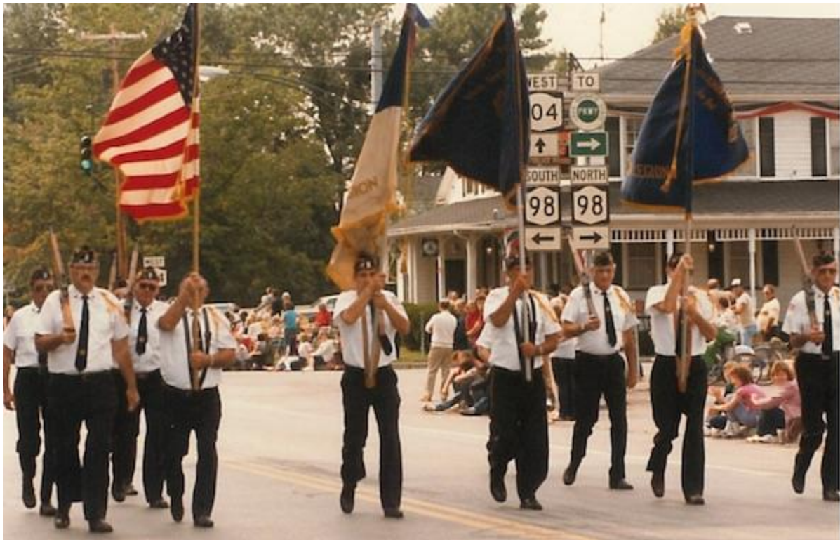
Legionnaires help celebrate.