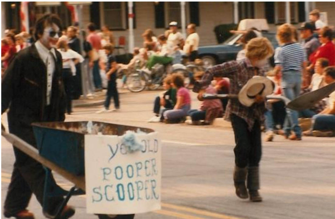
Hey somebody has to do it! With all the horses, the pooper scooper is a necessity.