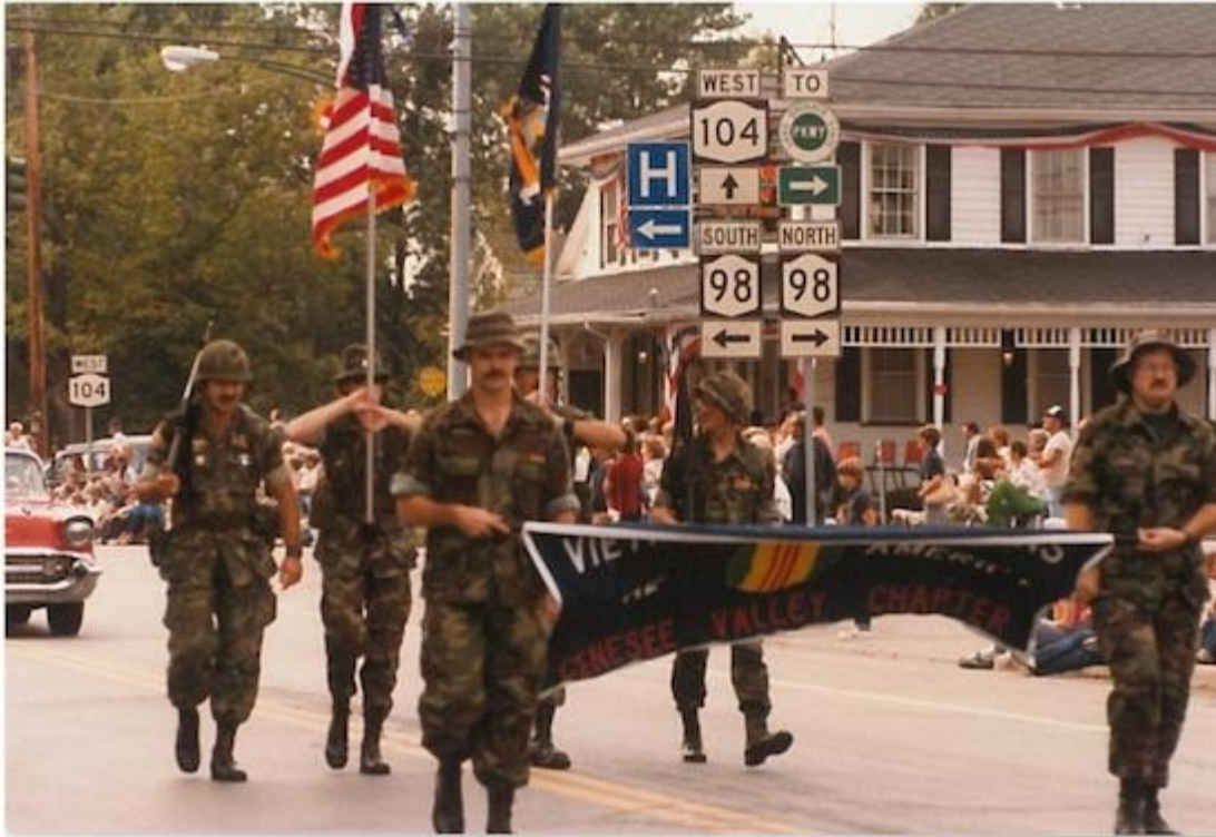
Thank you for your service! We salute our Vietnam vets, Genesee Valley Chapter!