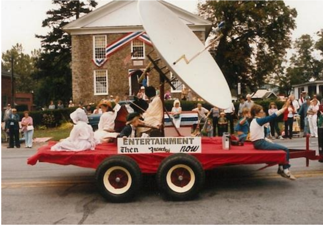
Frenchy's Appliance: Entertainment: Then and Now. (Looks like "Now" is a little outdated today.) But, Everett "Frenchy" Downey is still going strong.