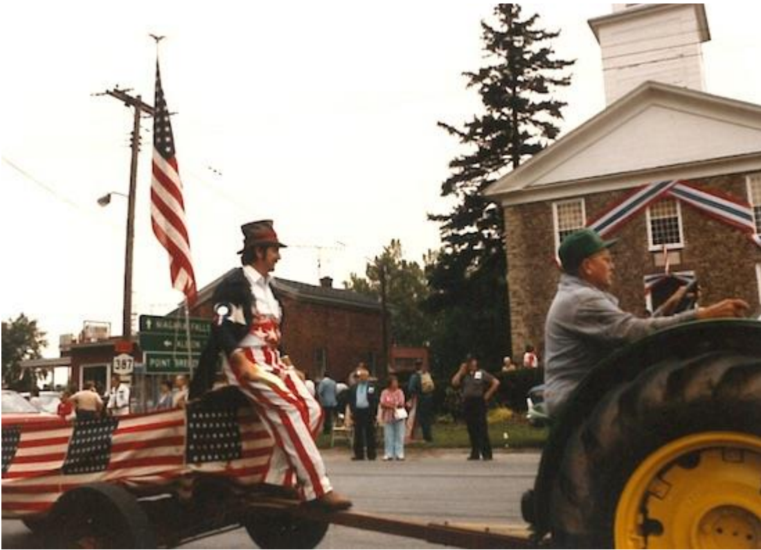
Uncle Sam gets a lift.