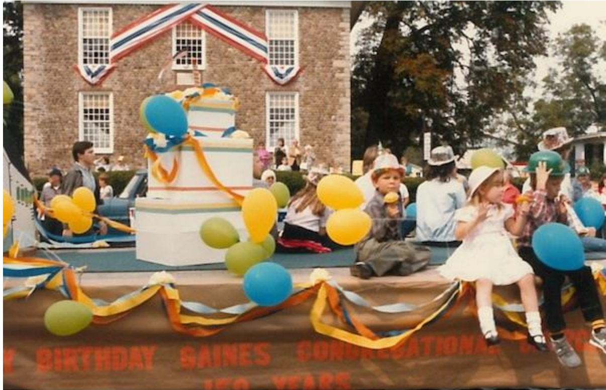
What's a birthday celebration without cake? Gaines Congregational Church Float. These little tikes are probably 40 years old now.