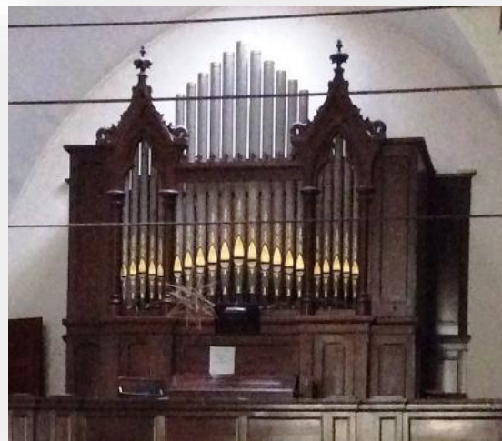
The Holley Presbyterian Church features a historic Steer & Webb tracker action organ built in the 1800s and transported to the church on the Erie Canal.

For reservations, call NOW 585-589-9013 or purchase your tickets online at CobblestoneMuseum.org .